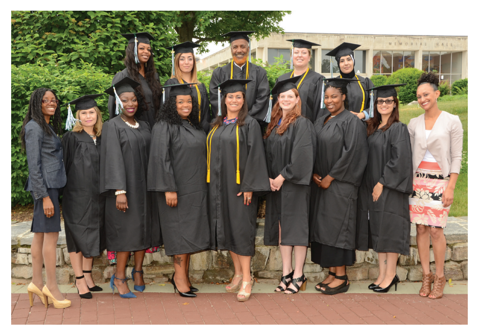
WIT and CT WAGE's proud graduates prepare for Commencement

Two Special Programs at Charter Oak State College continue to move students to self-sufficiency. At the June 5, 2016 graduation ceremony the Women in Transition (WIT) program celebrated its 17th graduation and the CT WAGE program celebrated its 9th graduation. Six students per program were conferred degrees.