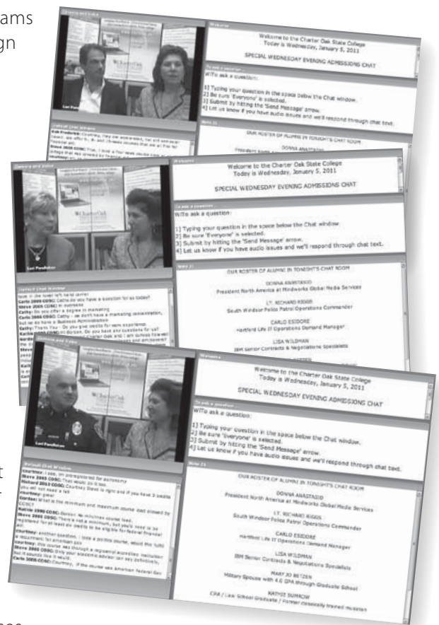
Charter Oak's recent live Web chat provided opportunity for visitors to communicate directly with the alumni panel.

The latter is personified by six alumni who have reached the pinnacle of success in their respective professional fields. The video, with a Spring 2011 target release date, will appear on the Charter Oak Web site,