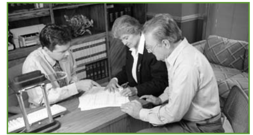
Charter Oak Paralegal programs provide a total understanding of the profession's nature and scope.